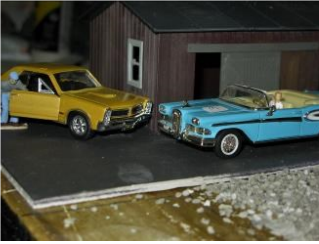
Above left and right: Will Kling's module is coming along nicely. Gas service center and antique cars.